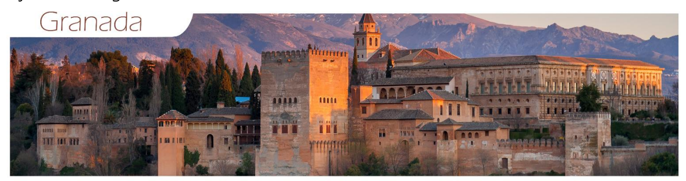
Day 4 Malaga, Granada

Breakfast at hotel. At 9:00 am in the hotel lobby, meet your private driver to start a day trip to Granada (90 minutes). Upon arrival, meet your private guide around 10:30 am for your guided tour of Granada. Internationally revered for its unique Alhambra palace, and enshrined in medieval history as the last stronghold of the Moors in Western Europe, you will visit Granada. We will arrange entrance tickets for your convenience to visit the Alhambra. This is a place to put down your guidebook and let your intuition lead the way – through the narrow ascending streets of the Albayzín and the tumbling white-walled house gardens of the Realejo quarter. Endowed with relics from various eras of history, there is lots to do and plenty to admire in Granada; the mausoleum of the Catholic monarchs, old-school bars selling generous tapas, and an exciting nightlife that bristles with the creative aura of counterculture. You may fall in love here, but you may spend days and weeks trying to work out why. Enjoy free time after your tour. In the late afternoon, meet your driver to return to Malaga. Overnight in Malaga. B/PD/G/ET/H