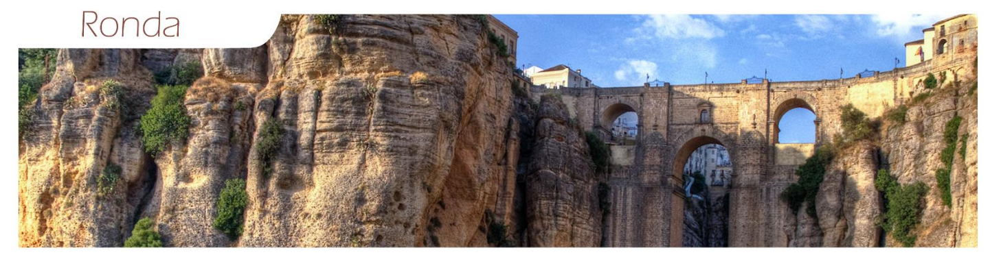
Day 5 Malaga, Ronda

Breakfast at hotel. Meet your private driver at 9:00 am in the hotel lobby for transfer to Ronda (1h 30 min). This beautiful whitewashed town will be a genuine experience of Spanish culture. Upon arrival around 11:00 am, meet your private bilingual certified guide for a two hour walking tour. Visit the legendary Plaza de Toros and learn the history of bullfighting. Gaze into the El Tajo River gorge, part of Andalucia's first natural park. Perhaps you will opt to taste local wines at the Sangre de Ronda winery.